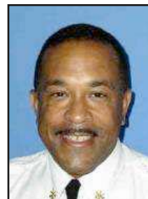
Deputy Fire Chief Eugene Campbell, Jr. of the Las Vegas Fire & Rescue department was promoted effective January 8, 2007