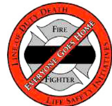
Everyone Goes Home Whistle-Stop Tour for Firefighter Safety: Raising Public Awareness. March 29-May 5, 2007. San Francisco; Sacramento; Los Angeles; San Diego; Phoenix; Chicago; Nashville; Atlanta; Tampa; Miami; Charlotte, NC; Washington, D.C.; Philadelphia; New York City; Hartford; Providence; and Boston.