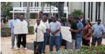
Members of the Progressive Firefighters Association of Miami-Dade hold a press conference to show their support for a member who was wrongly suspended.