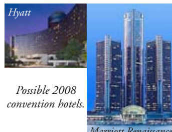
Possible 2008 convention hotels.