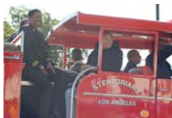
Stentorians participating in the 22nd LA Annual MLK parade.